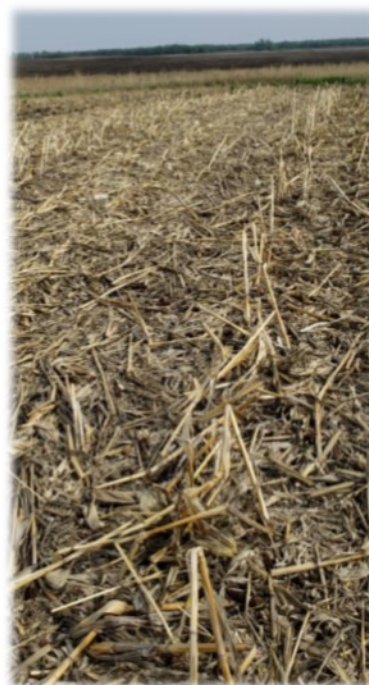
Fig 1. Corn residue prior to planting.