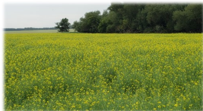
Fig 3. No-till Canola in flower