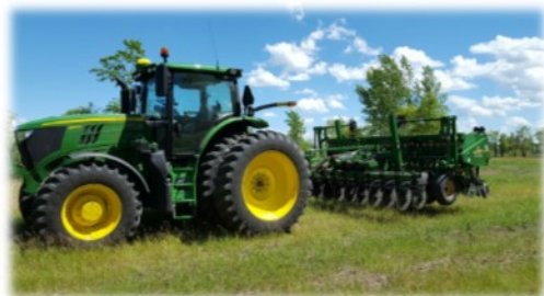
Fig 2. Conservation District No-Till Drill.

If you are considering using our services next year, please call our office and get your name on the list.